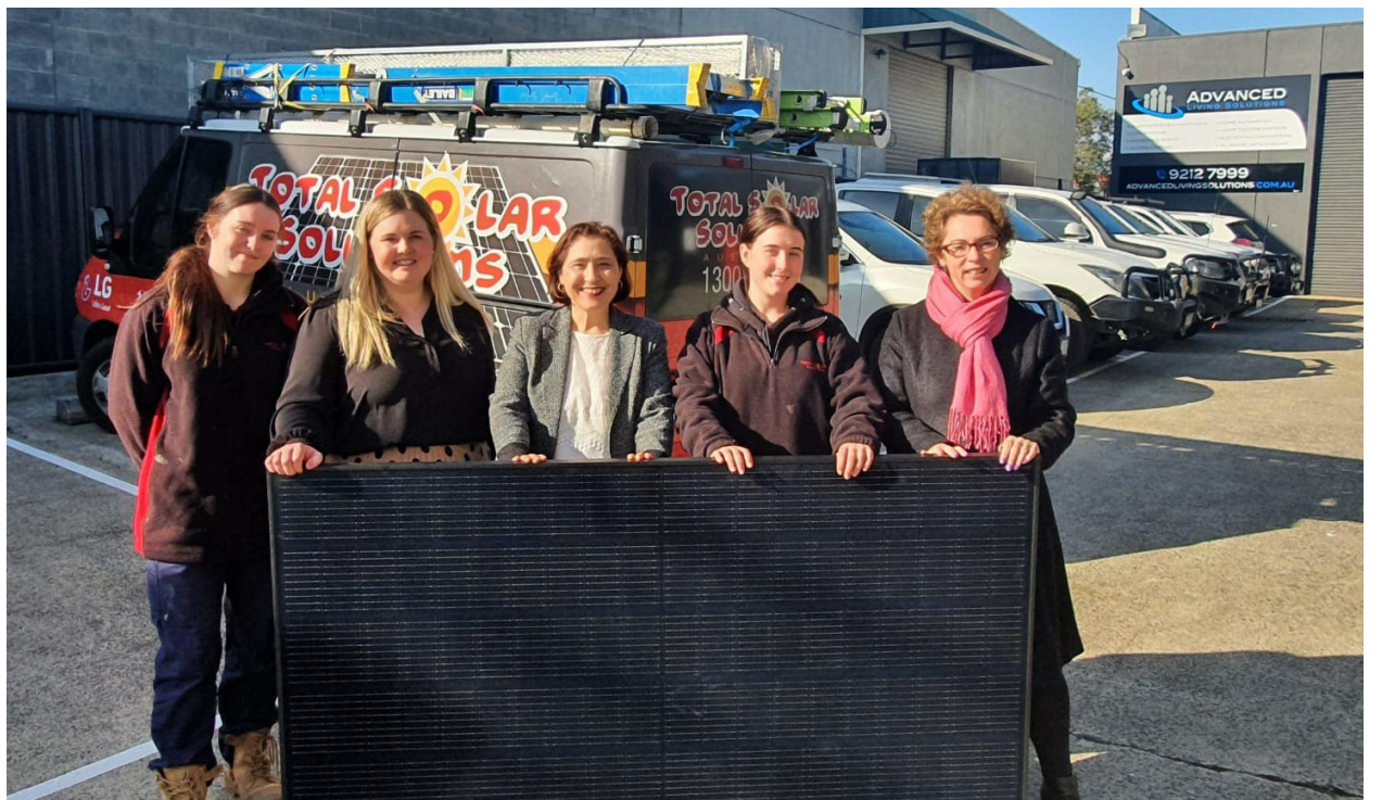
Sonja Terpstra MP and Minister for Energy Lily D'Ambrosio with Darcey and Madi from Total Solar Solutions Australia

Find out more about Solar Apprenticeships for Women here: solar.vic.gov.au/solar-apprenticeships-women